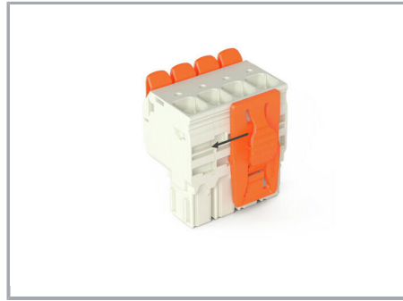
Locking lever; for field assembly