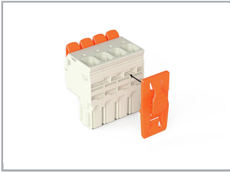
Locking lever; for field assembly